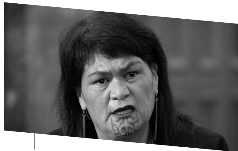
Foreign Affairs Minister Nanaia Mahuta in 2021.

Māori women have a history as defining members of parliament: the first was Iriaka Rātana in 1949. We can also think of Nanaia Mahuta, Aotearoa's (NZ's) first Māori Minister of Foreign Affairs from 2020-2023 who was the first to wear the traditional moko kauae to Parliament (2016).