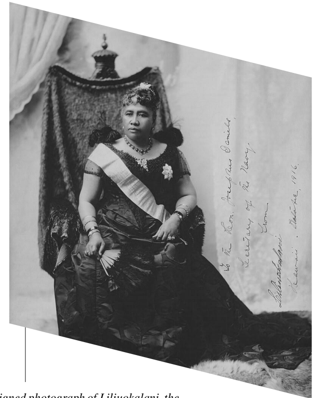
Signed photograph of Liliuokalani, the last sovereign of the Hawaiian kingdom. Gelatin silver print, sepia toned; sheet 38 x 29 cm. Notation on recto: "To the Hon. Josephus Daniels, Secretary of the Navy, from Liliuokalani, Hawaii, October 1916."

Queen Salamāsina's rule was foundational in Sāmoan history. As we were unable to find a visual support to explain her further to you, we encourage you to go to YouTube, as many videos / mini documentaries were made to understand and celebrate the memory of this great, peaceful queen.