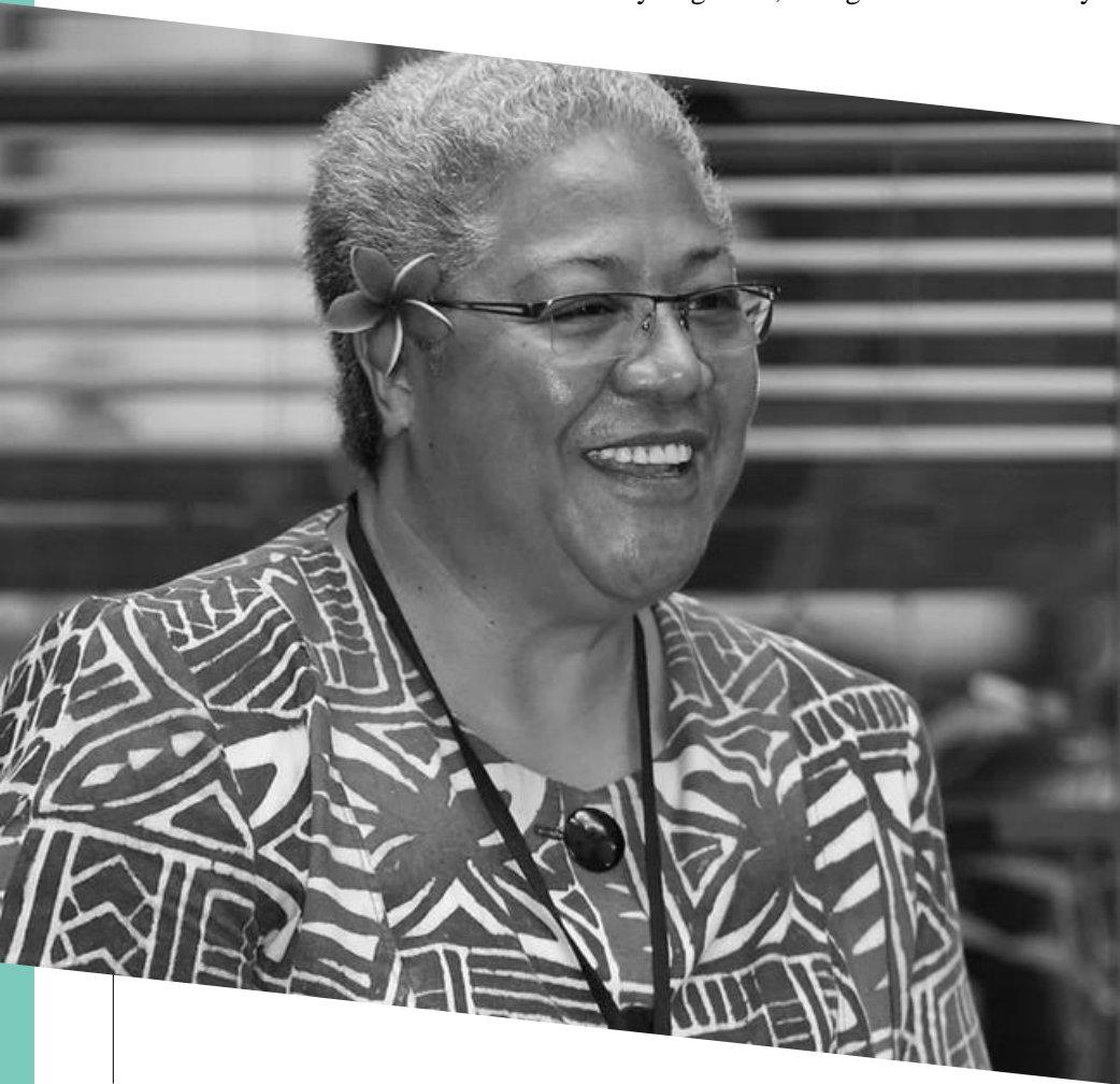
A court ruling has ended a months-long political crisis, allowing Fiamē Naomi Mata'afa (here in 2013) to become the first woman to lead Samoa.

To discover more about the topic, we encourage you to check out the Pacific women's feminist movements, mainly visible during Pacific Feminist Forums held each year. There, you can explore what it means to be a Pacific feminist, who identifies as such and what the key struggles are. Advocates and partners of the LGBTQIA+ communities across the islands, the movement fights for inclusivity of gender, background and ethnicity.