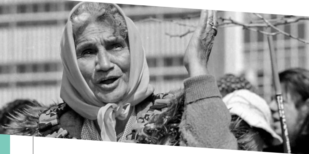
Whina Cooper in Hamilton during the land march. Here she addresses a crowd after the Māori march to Parliament.

Drawing this struggle into a wider context, we can see how, today, indigenous women have played key roles in political activism. For example, since the second half of the 20 th century, political movements advocating for indigenous rights saw at its head a wave of ecofeminist artists and activists.