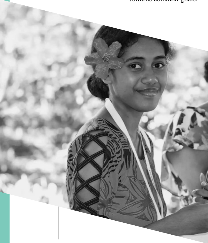
A group of schoolgirls accompany their professor from Tonga to the May 2023 Pacific Feminist Forum.

The key takeaway from this 2023 forum was the intense solidarity proven by the presence of all the activists in Fiji, especially under the Covid-19 crisis. Present this year was Tonga, the Cook Islands, Tuvalu, New Caledonia, Papua New Guinea, Palau, Solomon Islands, Sāmoa, Fiji, Vanuatu and West Papua.