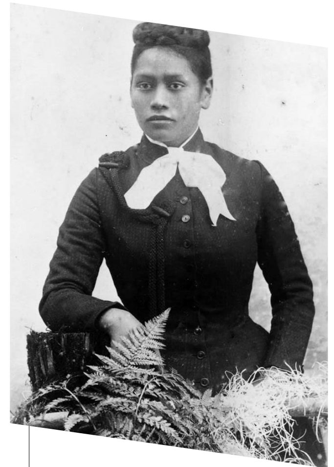
Meri Te Tai Mangakāhia (1868-1920), circa 1890. Meri was a member of the Kotahitanga (Māori Parliament) movement.